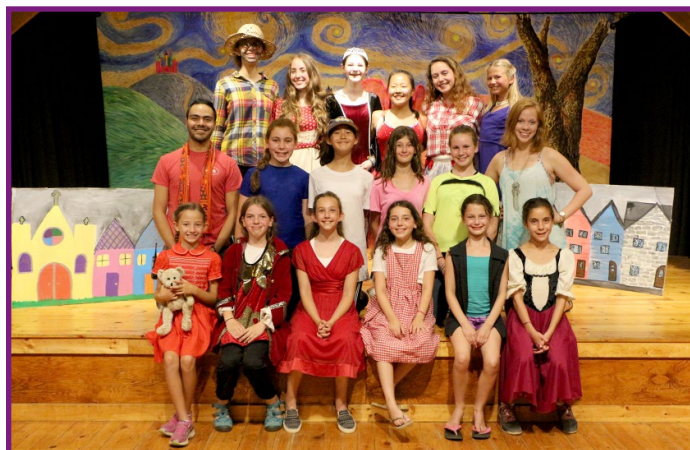
SESSION 1, SHOW 2: Beauty is a Beast