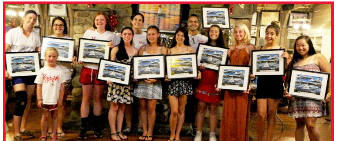
2nd Session - 7 year Plaques