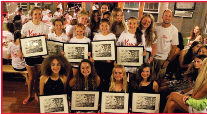
1st Session - 5 year Plaques