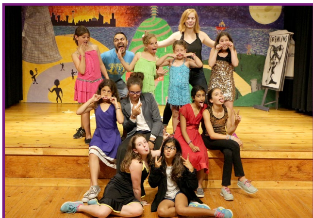
SESSION 1, SHOW 1: Bedtime Stories 2.0

We can't believe 2016 is gone as it was so fantastic and fun, but we can't wait to see what 2017 will have for us!