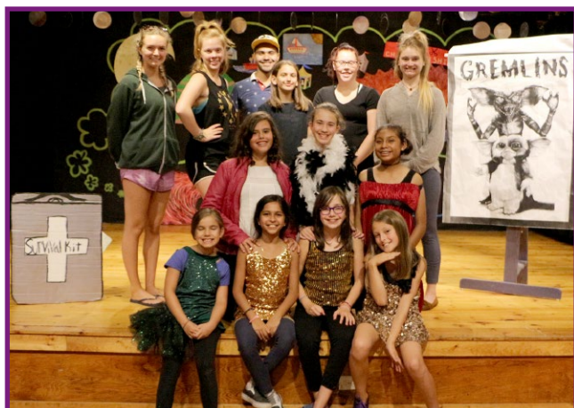
SESSION 2, SHOW 1: Bedtime Stories 2.0