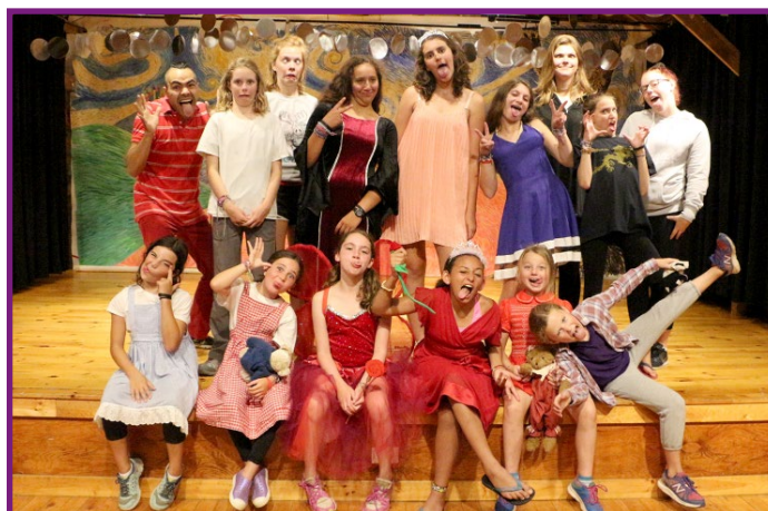
SESSION 2, SHOW 2: Beauty is a Beast