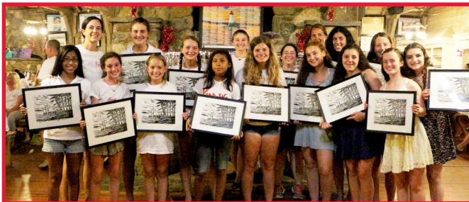
2nd Session - 5 year Plaques