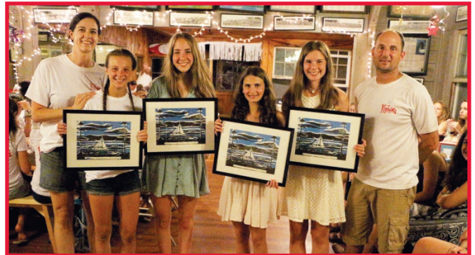
1st Session - 7 year Plaques