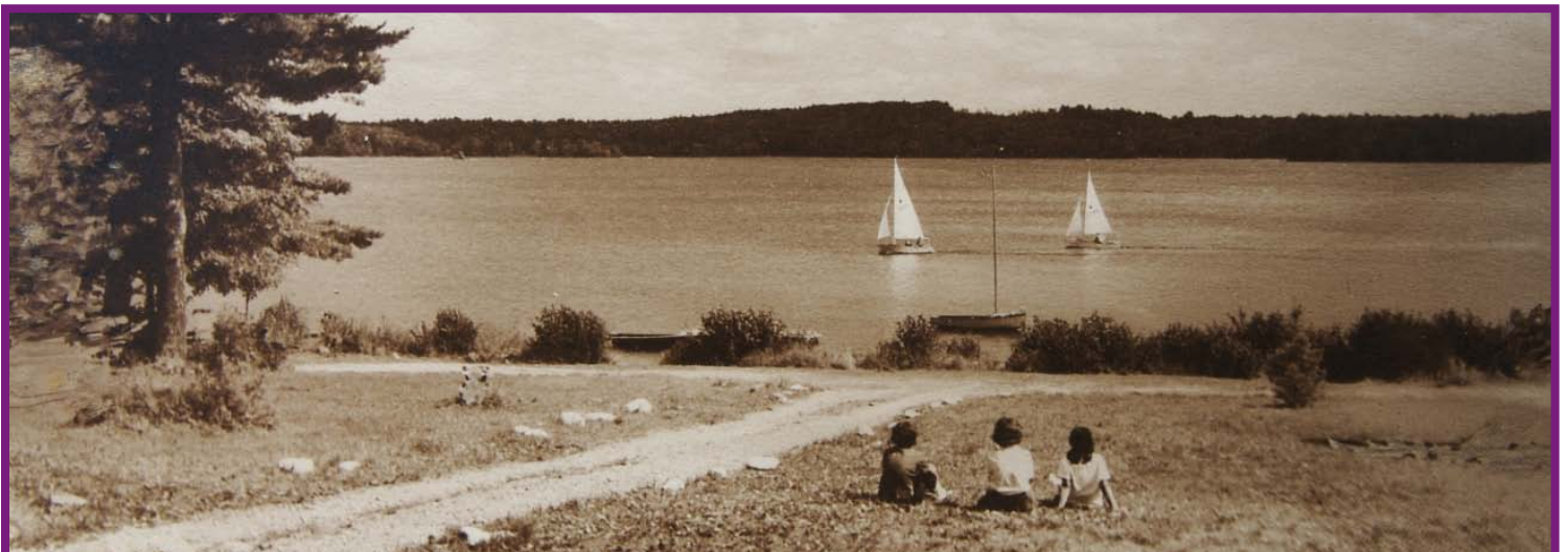
Kippewa Circa 1962