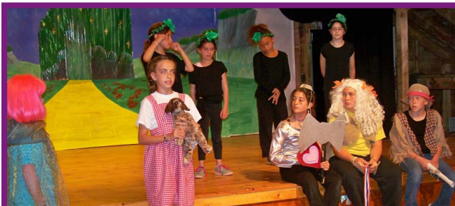
THE WIZARD OF OZ