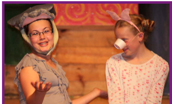
ONCE UPON A DIME