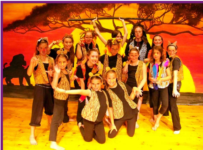
THE LION KING

THE KIPPEWA PLAYHOUSE IS THE PLACE TO BE ON A SUMMER NIGHT!