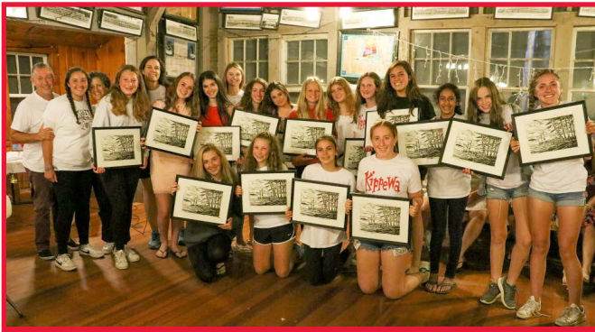
1st Session - 5 year Plaques