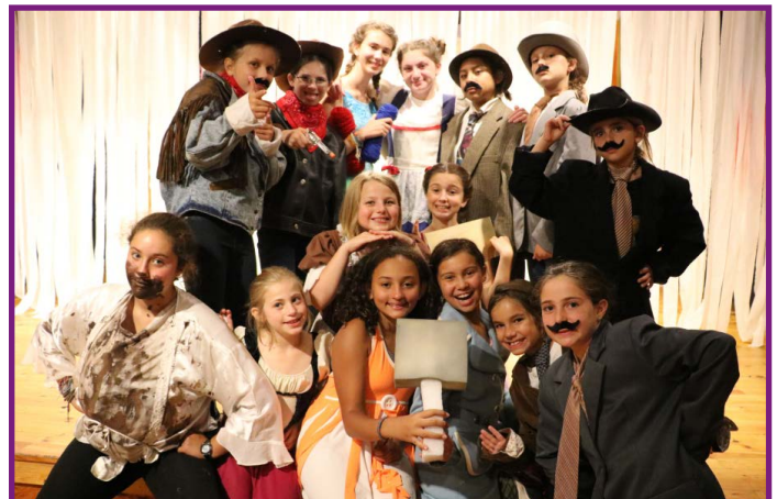
SESSION 2, SHOW 2: The Search for Five