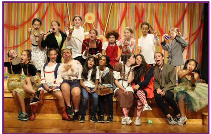
SESSION 1, SHOW 2: The Woe of Chocolate