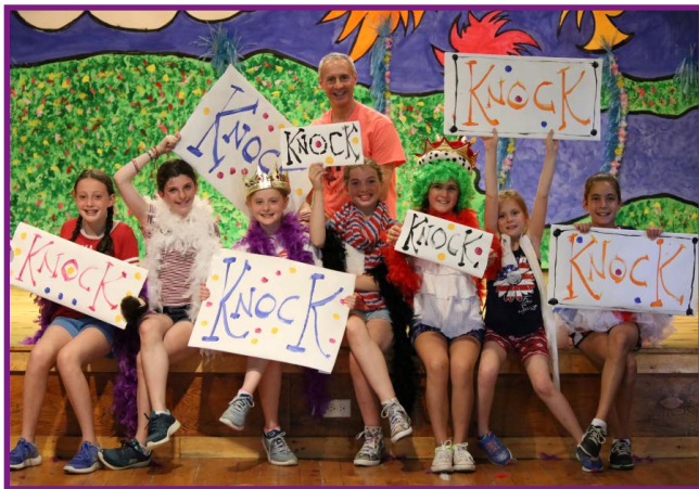
SESSION 1, SHOW 1: Opportunity Knocks

Please join us for our 2018 season. There is room for everyone!