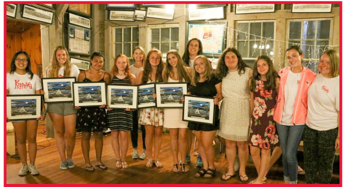
1st Session - 7 year Plaques