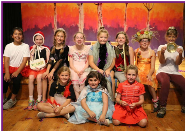
SESSION 2, SHOW 1: In Search of a Happy Ending