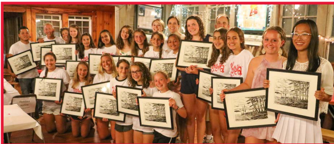
2nd Session - 5 year Plaques