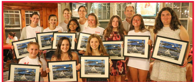
2nd Session - 7 year Plaques