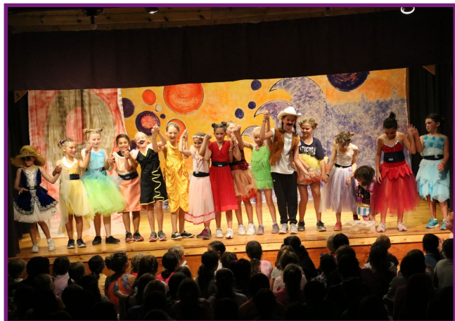
SESSION 2, SHOW 1: Paradise Found