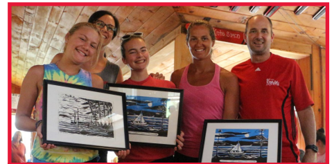
2nd Session Plaques