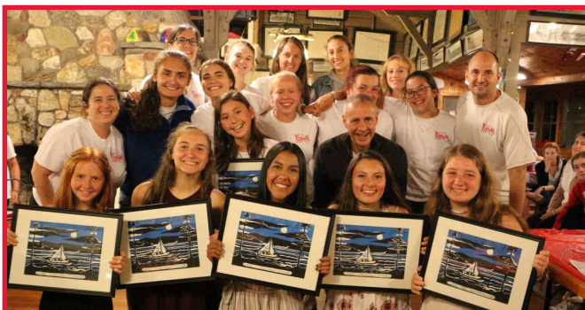
1st Session - 7 year Plaques