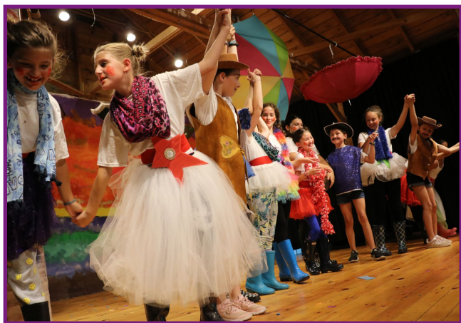
SESSION 1, SHOW 1: Paradise Found

We had a terrific summer in the Playhouse and look forward to 2019!