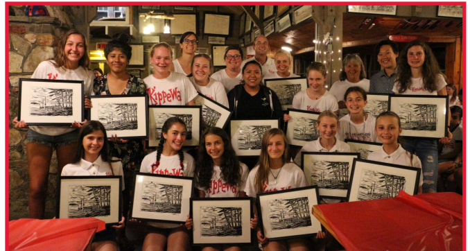
2nd Session - 5 year Plaques