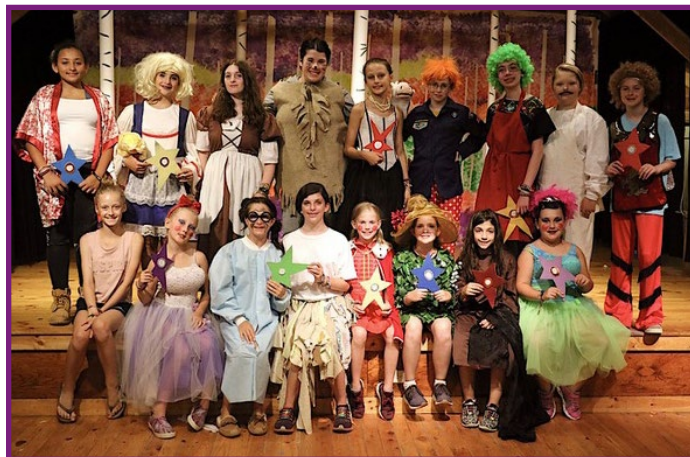
SESSION 2, SHOW 2: Confusion Reigns