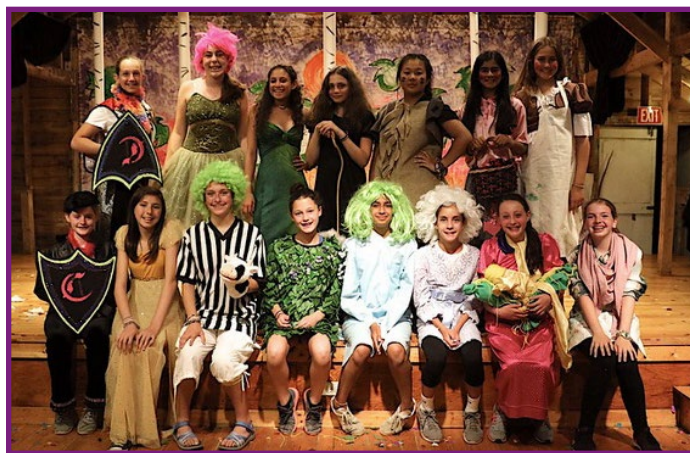
SESSION 1, SHOW 2: Confusion Reigns