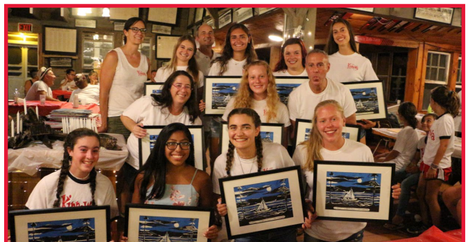
2nd Session - 7 year Plaques