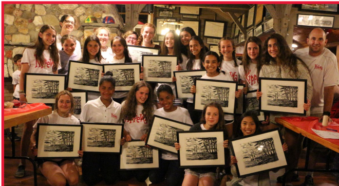
1st Session - 5 year Plaques