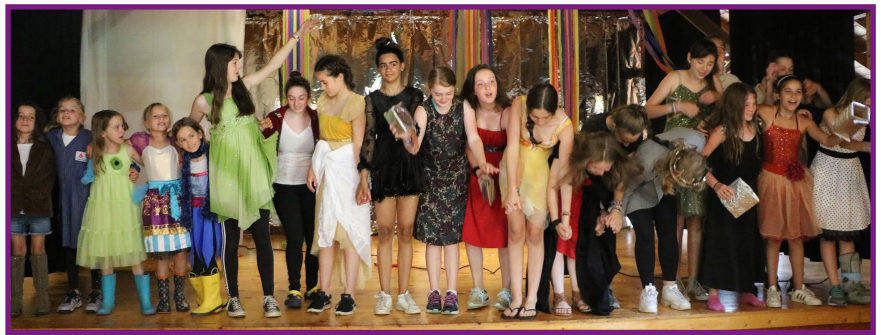
SESSION 1, SHOW 2: The Woe of Snow