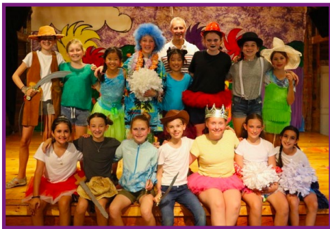
SESSION 1, SHOW 1: Horton Hatches an Egg

We had a terrific summer in the Playhouse and look forward to 2020!