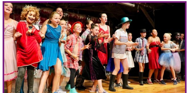
SESSION 2, SHOW 2: The Woe of Snow