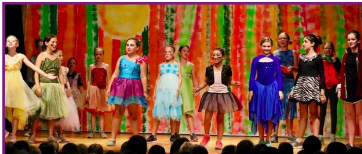
SESSION 2, SHOW 1: Horton Hatches an Egg