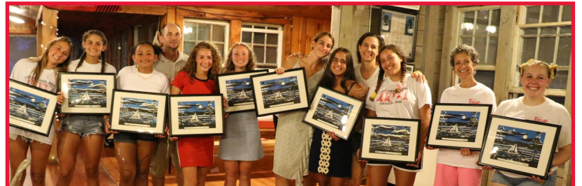
2nd Session - 7 year Plaques