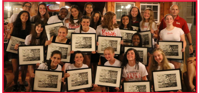
1st Session - 5 year Plaques