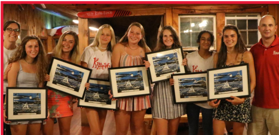
1st Session - 7 year Plaques