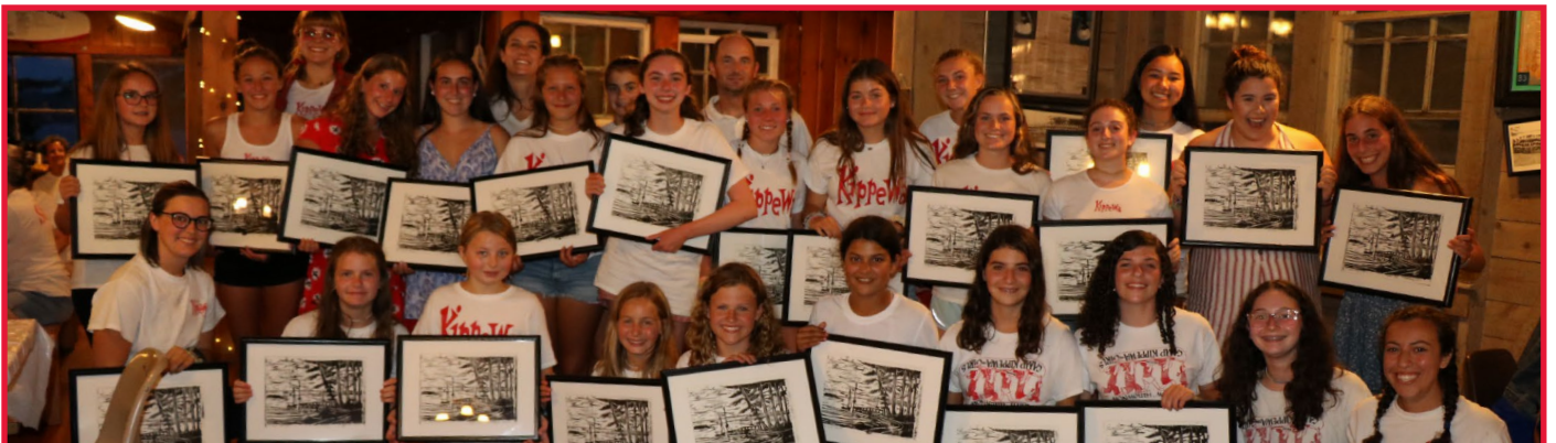
2nd Session - 5 year Plaques